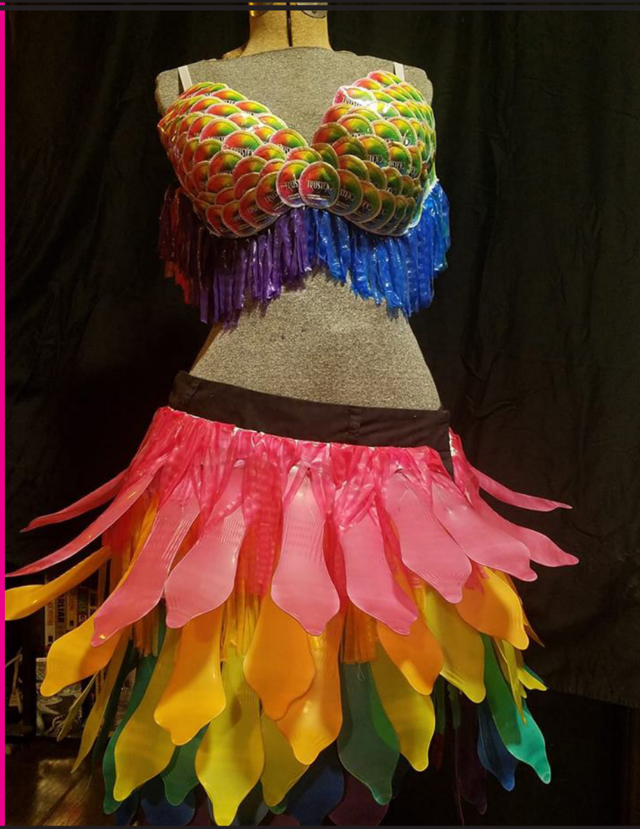
2019 winning fashion by Veronica Foster.

The Little Blue House is seeking guest designers to create fashion apparel out of condoms for our upcoming special event: CONDOMANIA!